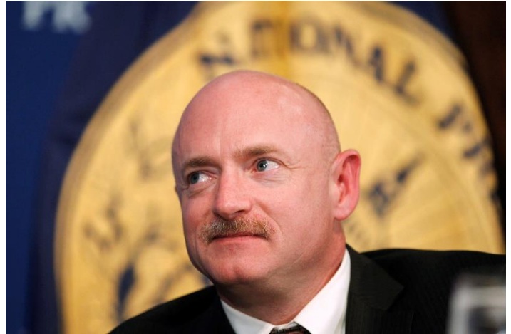
Giffords gun control org founder and Arizona Senate candidate Mark Kelly

On the table is a fifty-two state strategy that could “ permanently change the political map .” Simply by granting Washington, D.C., statehood status, Democrats would be guaranteed two additional senators. Statehood for Puerto Rico could mean an additional two senators, as well as five House seats.