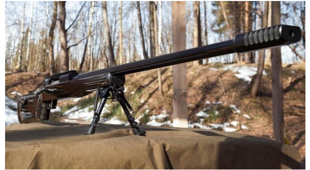
SVLK-14S Sumrak Lobaev Arms

“Such a projectile can pierce 3cm-thick metal. Imagine what would happen if it hit a human being? No body armor would help,” noted the engineer.