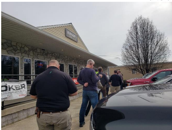
(Customers stand six feet apart while waiting in line to buy guns and ammo)

"Where we're starting to see issues on are states that are 'point of contact' states that do their own background checks," Oliva said. "Colorado is up to two days now. Washington state, they're looking at waits up to three weeks."