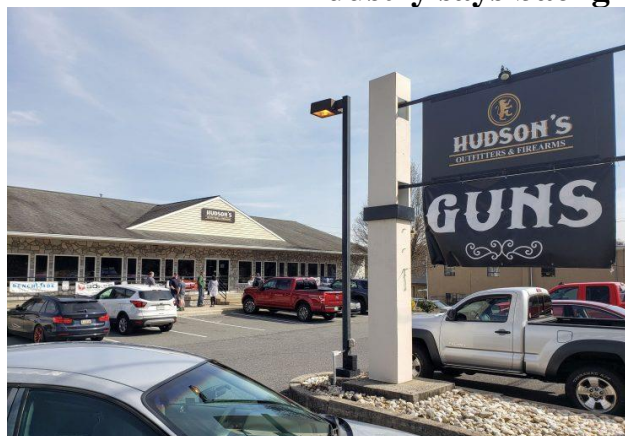
People wait in line outside Hudson's Outfitters & Firearms

Industry says background checks surged 300 percent