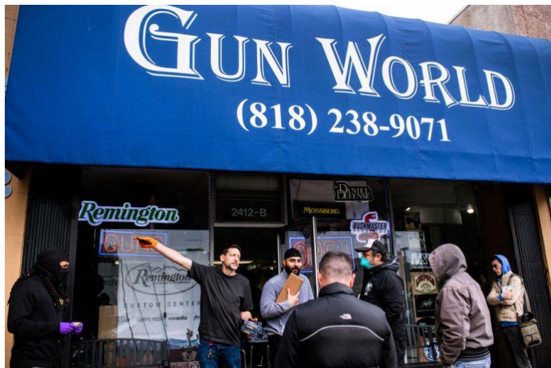
Shoppers wait in line to purchase ammunition and guns at Gun World in Burbank, California on March 17.