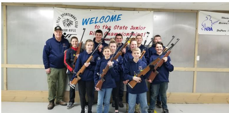
Medford Rifle Club Team