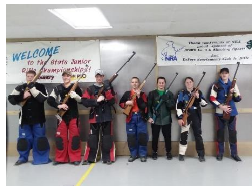
De Pere Sportsman's Club