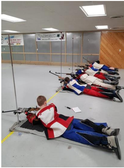
Junior State Championship, De Pere Sportsman's Club